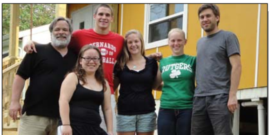
Young Adult Mission Trip - page 8