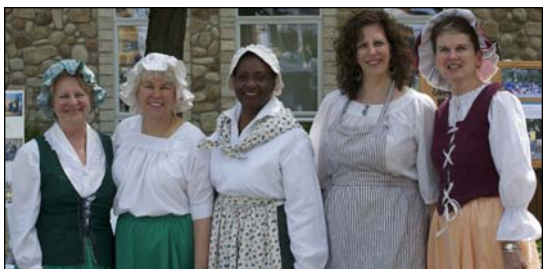
Charter Day Festivities - page 6