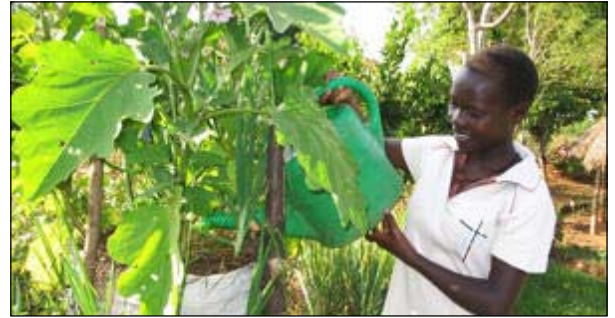
Example of the bag gardens that we will help teach families in Ecuador to use on the trip next summer.