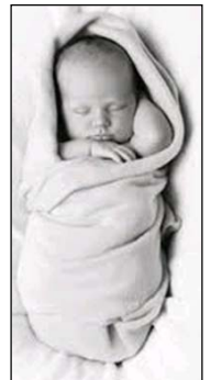
A Savior is Born