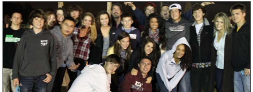
Senior High Fellowship enjoyed some fall fun at the annual Haunted Hayride on Sunday October 24, 2010.