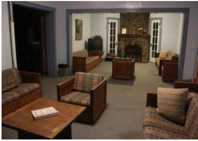
Housing at the Hoener Inn