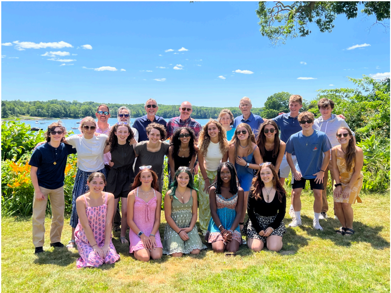
2022 Maine Work Camp High School Mission trip.